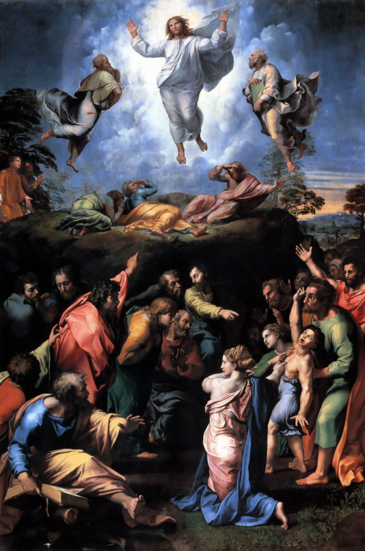
The Transfiguration by Raphael