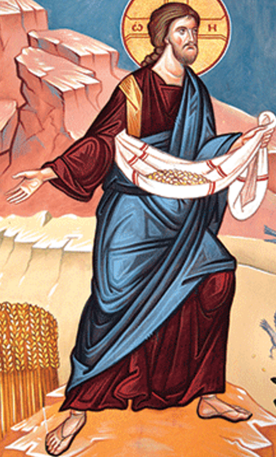
Sower of the Seed by Shkolnik