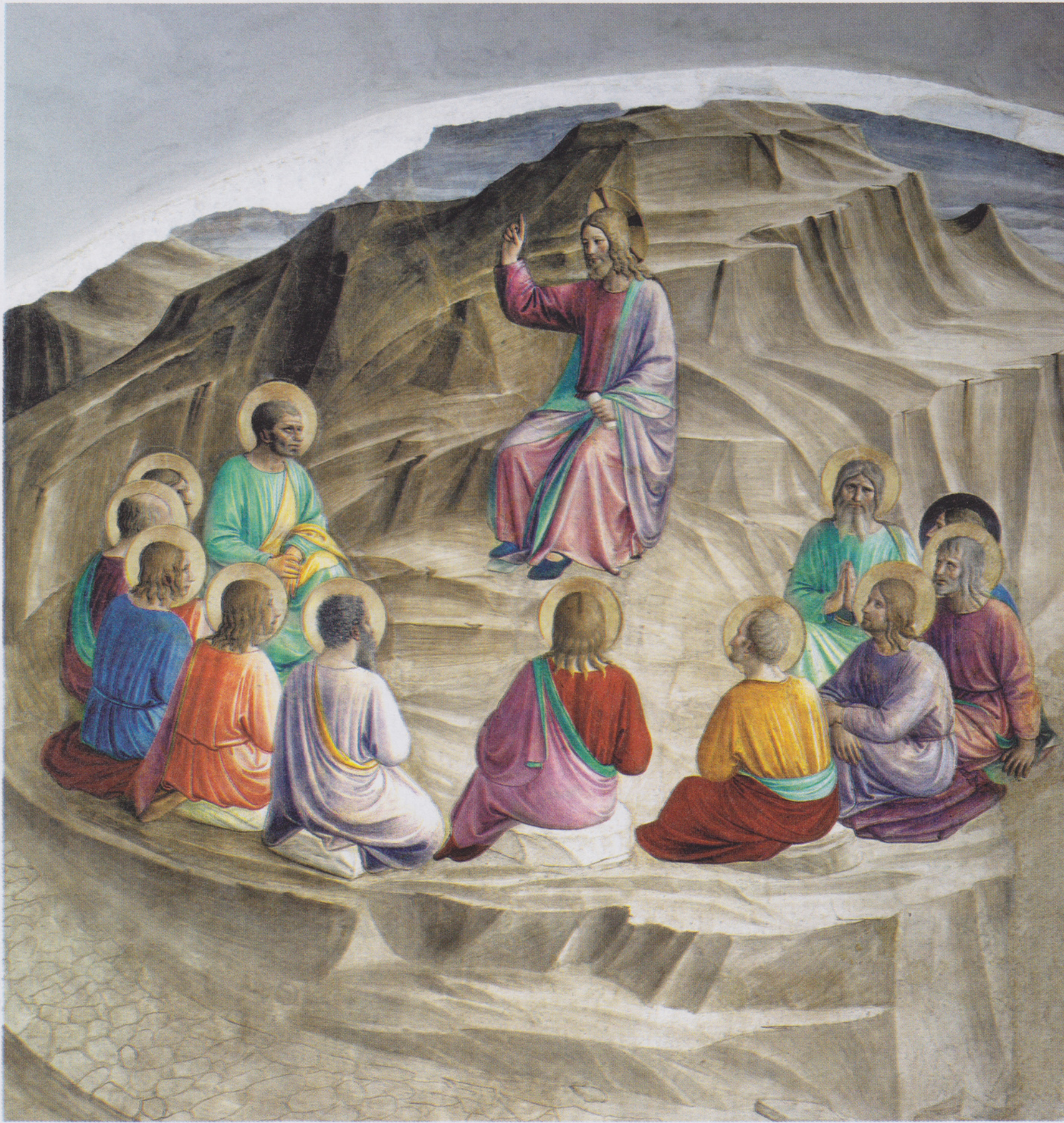
Sermon on the Mount by Fra Angelico