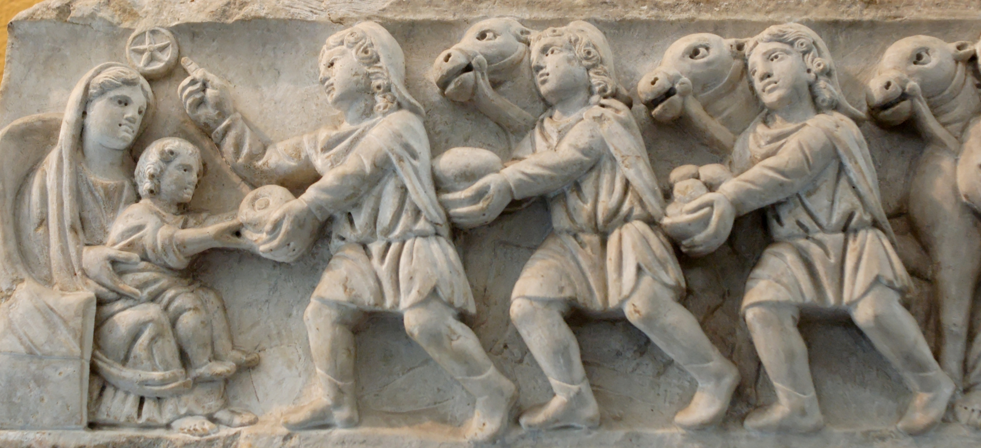
Adoration of the Magi - Vatican Sarcophagus Relief Jesus is sought by God-fearers, gentiles, who come from afar