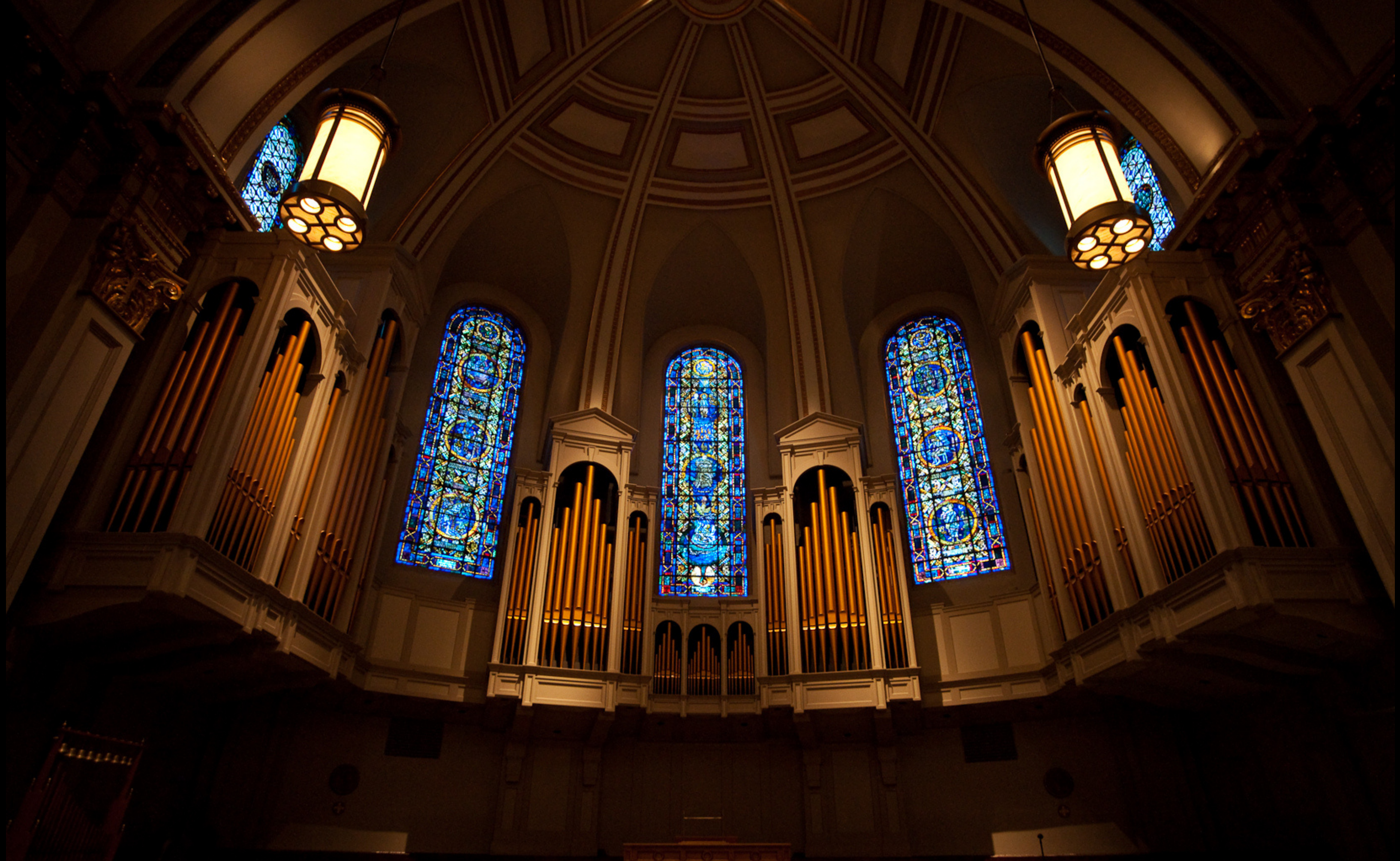
The Windows from St. James Cathedral (East Apse)