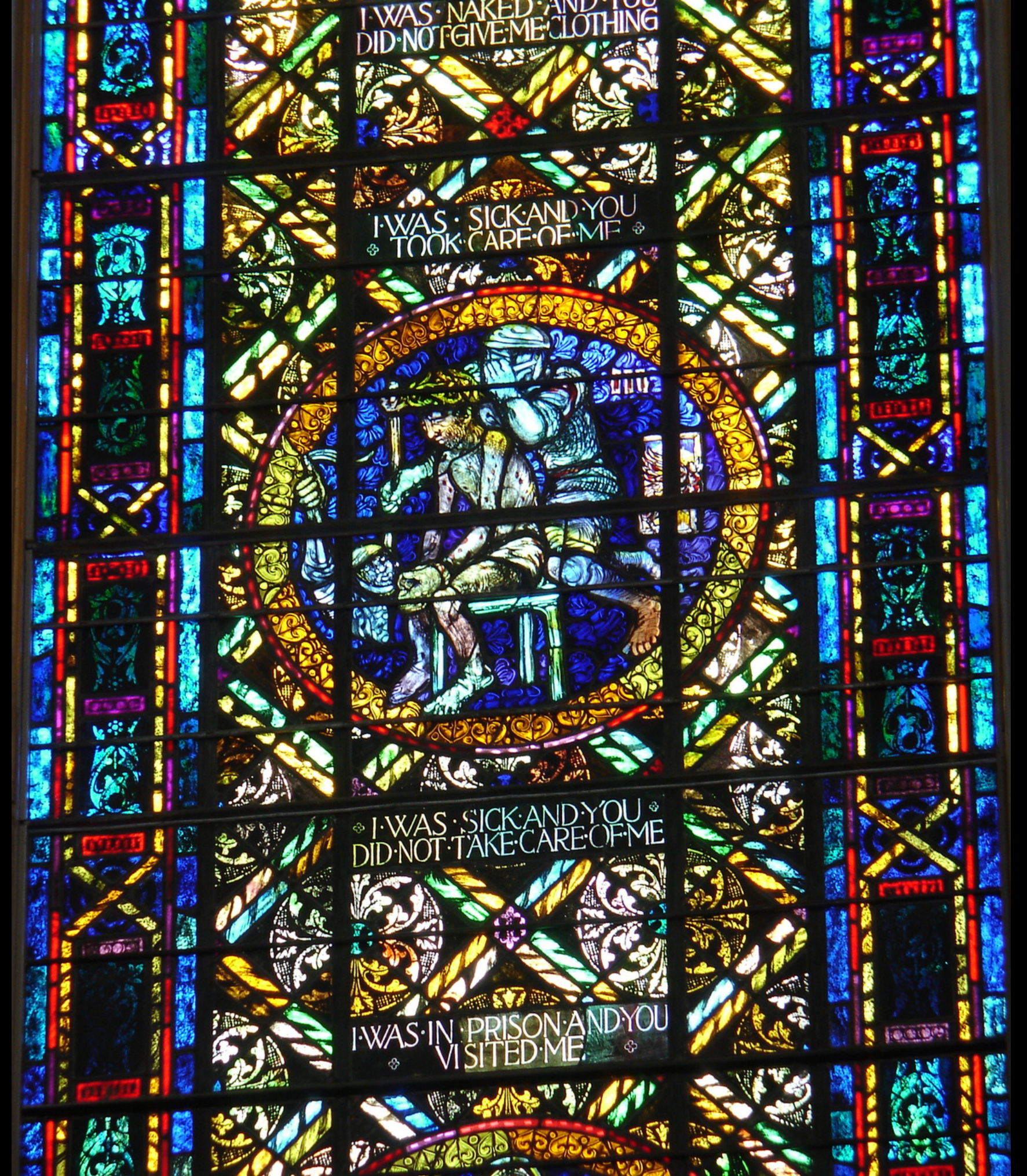
The Windows from St. James Cathedral