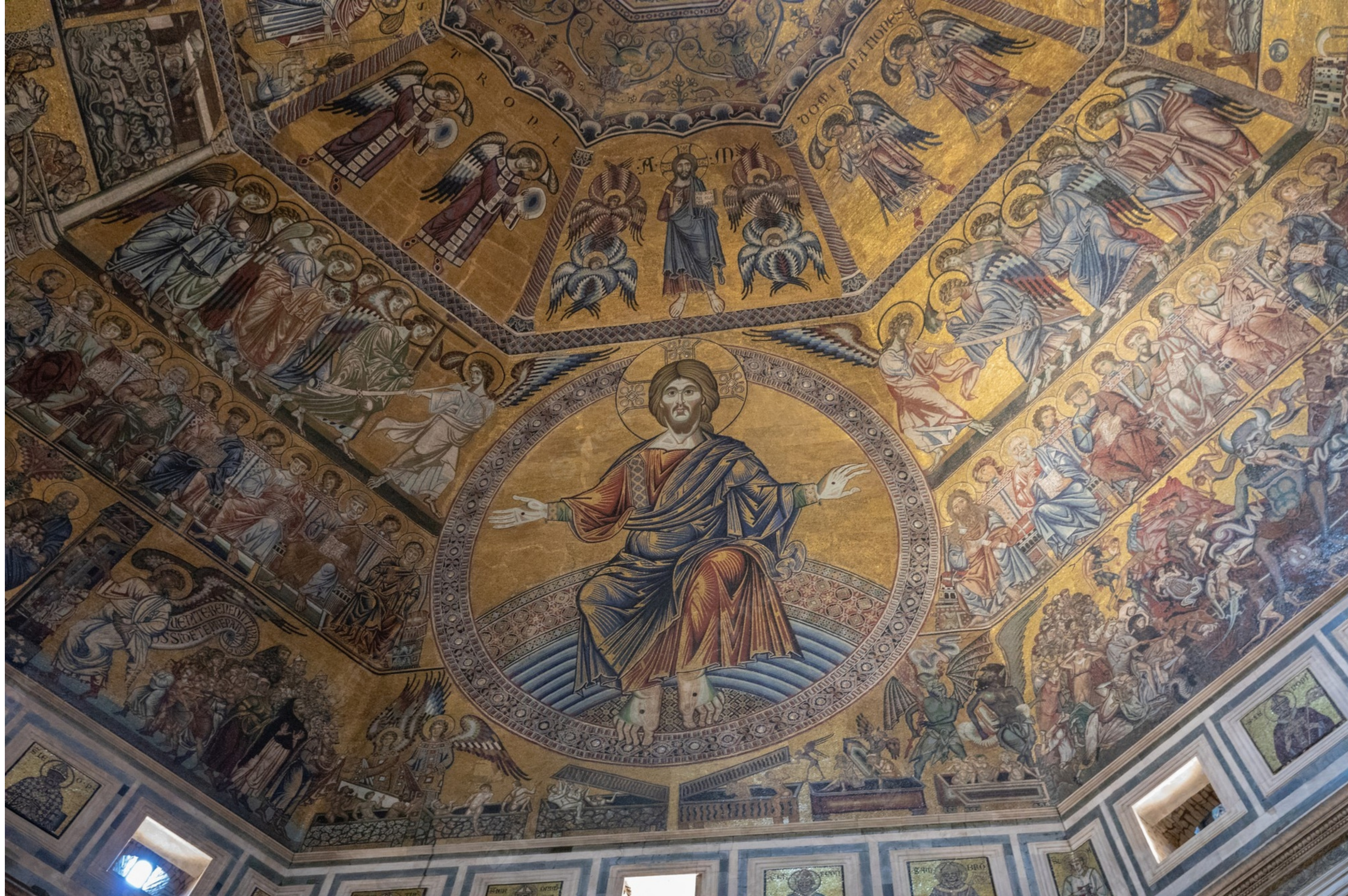
The Baptistery at the Duomo in Florence by Marcovaldo