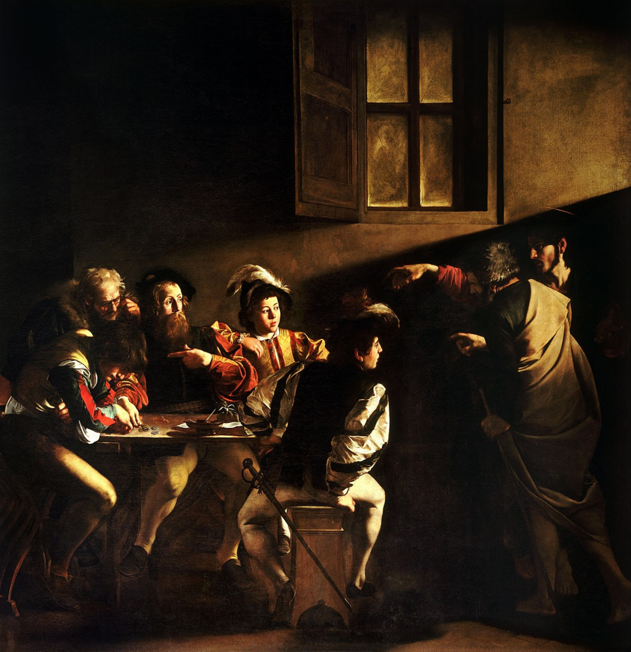
The Call of St. Matthew by Caravaggio