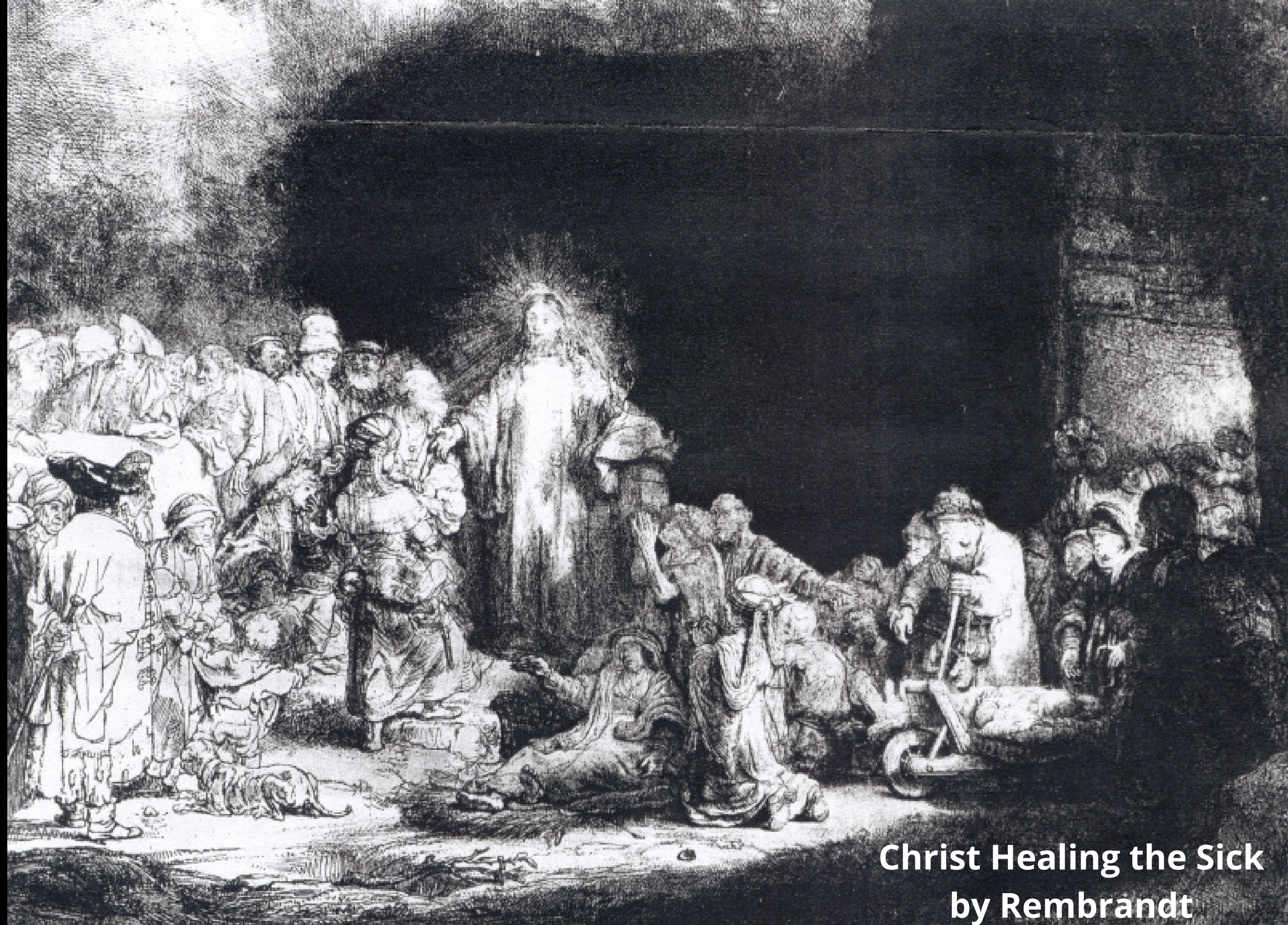
Christ Healing the Sick by Rembrandt