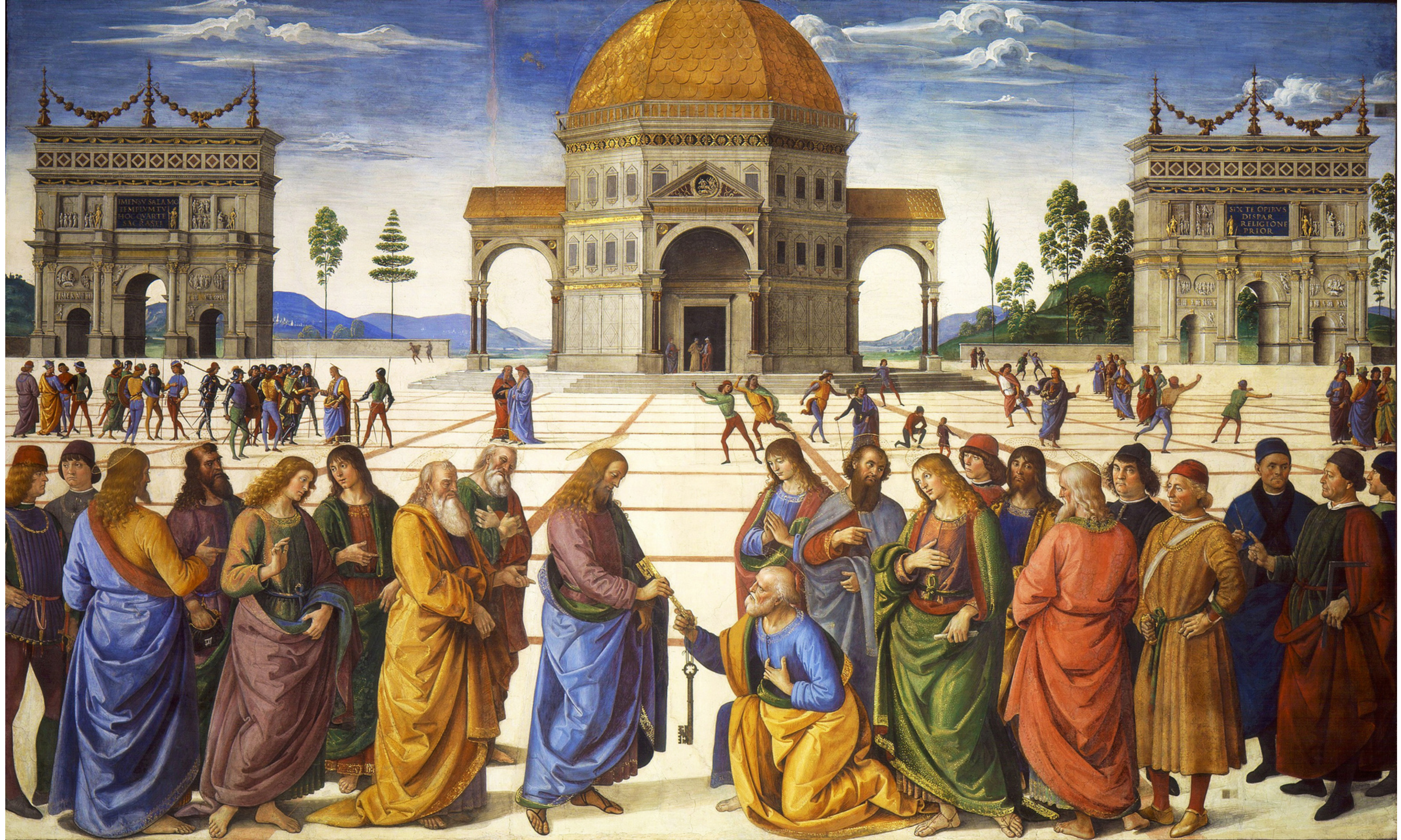
Delivery of the Keys by Perugino

Chapter 16: Peter's profession of faith in Jesus as "The Christ, the Son of the Living God"