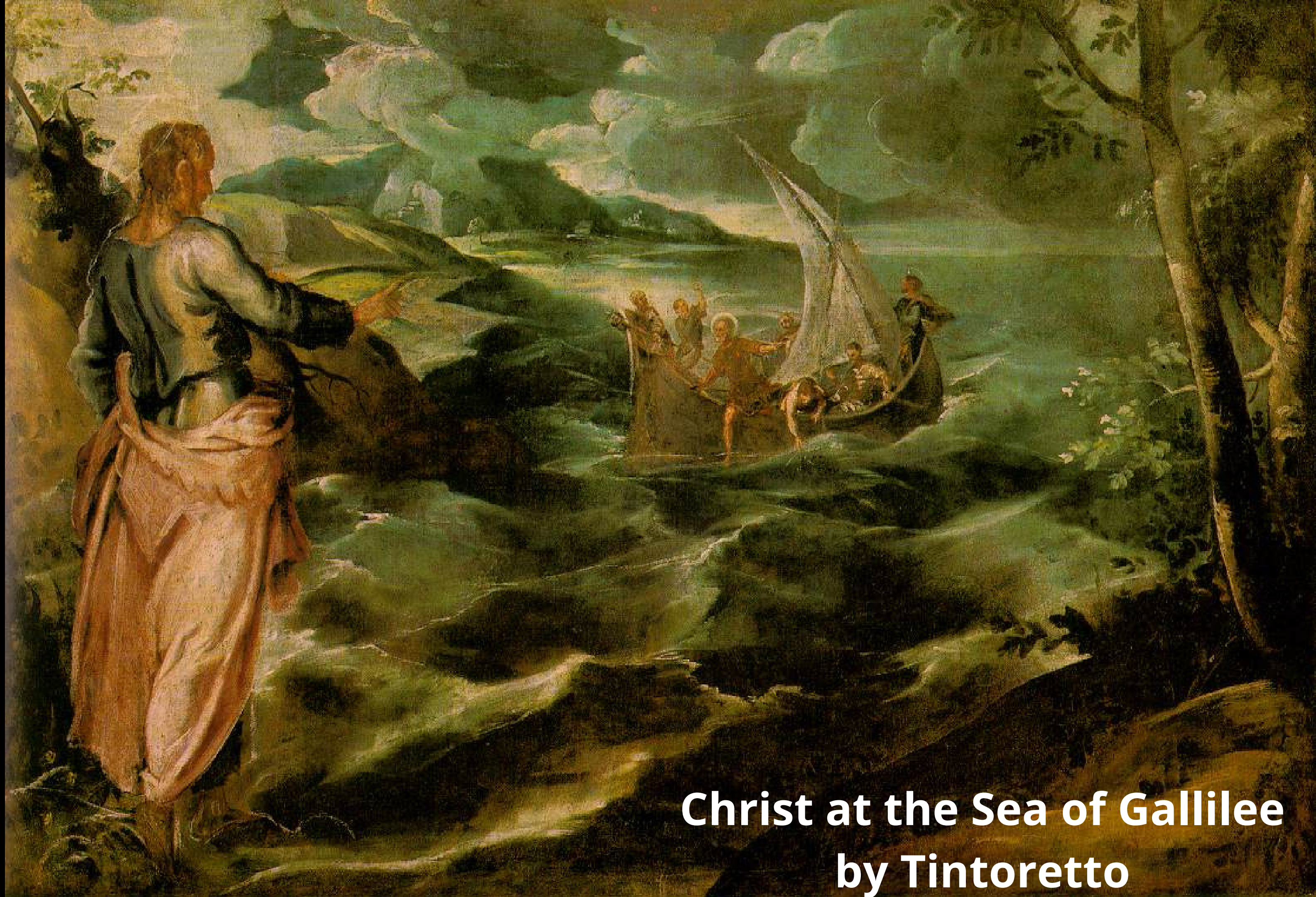
Christ at the Sea of Galilee by Tintoretto