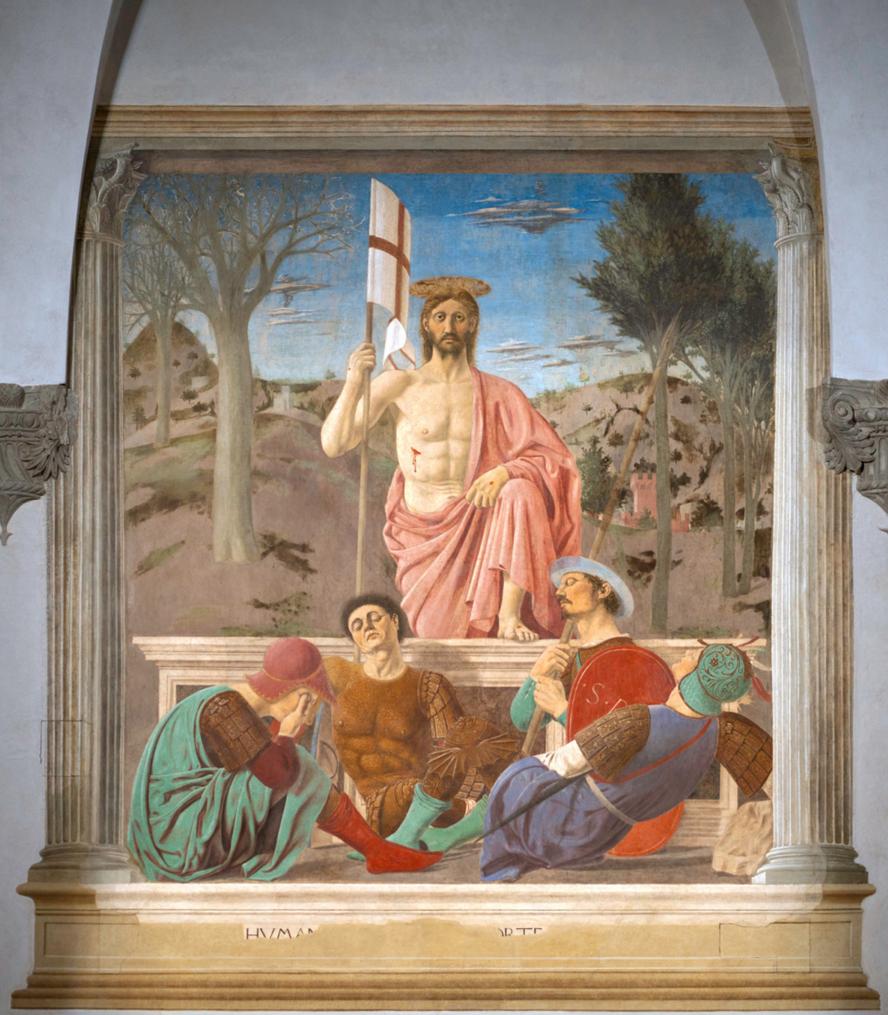
Jesus Rising from the Tomb by della Francesca