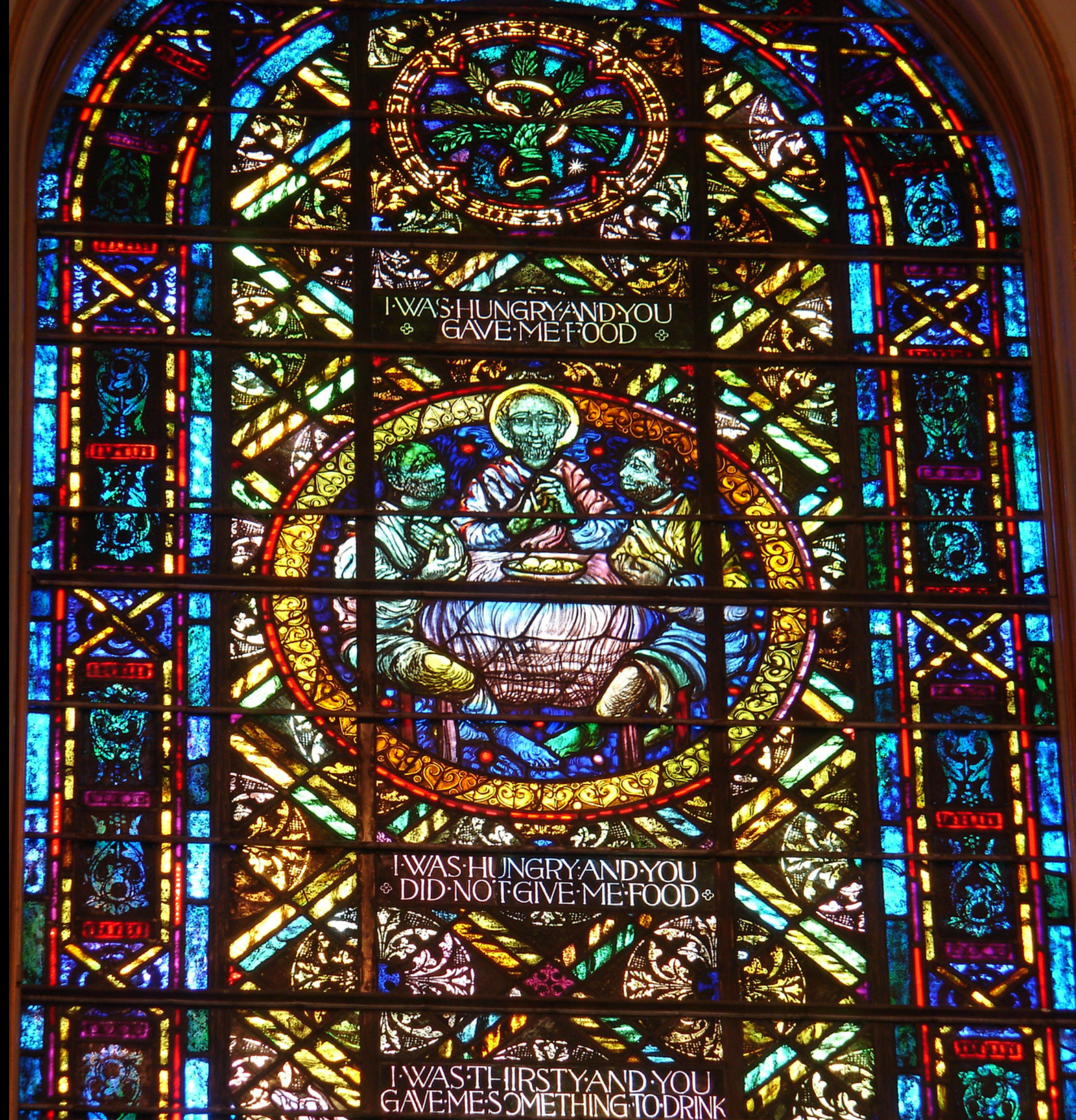
The Windows from St. James Cathedral