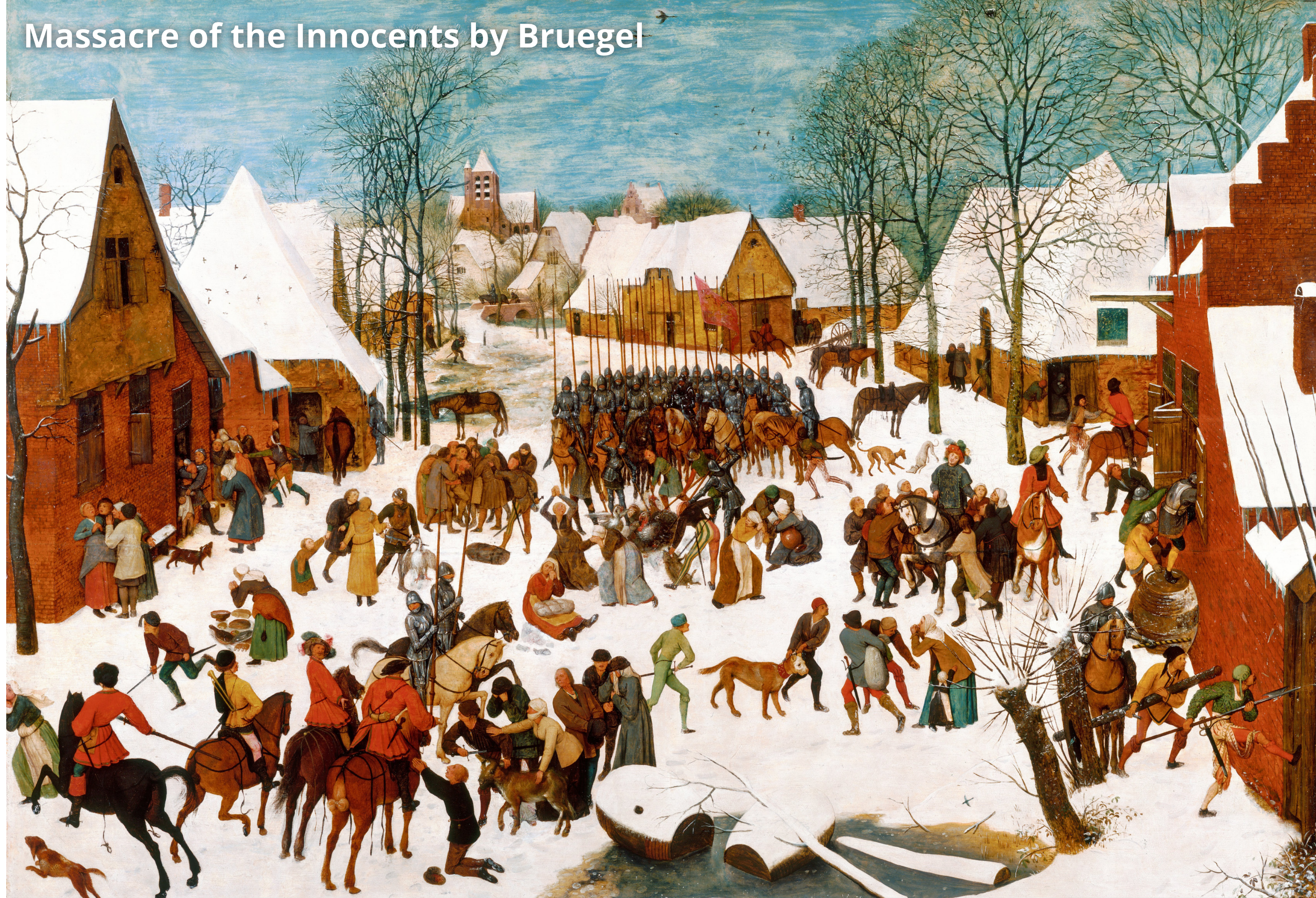
Massacre of the Innocents by Bruegel